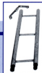
1-1/2" OD x 48" Stainless Steel SGR Guiderail Extension