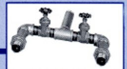
Galvanized or Stainless Steel Duplex Discharge Kit