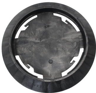
Snap on anti-float